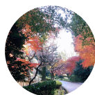
Cecilia Smith-Fuji... Shirayuri University