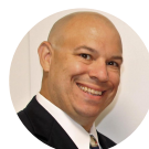
Edo Forsythe Hirosaki Gakuin Uni...